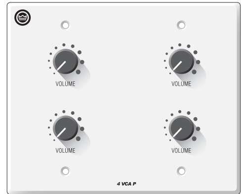
Figure 2. 4-VCAP